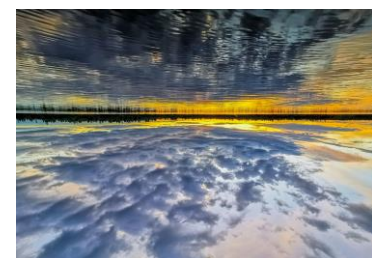
Sunset on Indian Arm Lake

Come and stay...get away from the everyday, and take a step back to a simpler, more serene time.